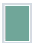
1/1 page 190 x 270